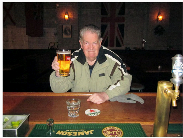
In Toronto, Dec.31, 2014 with a rare beer.