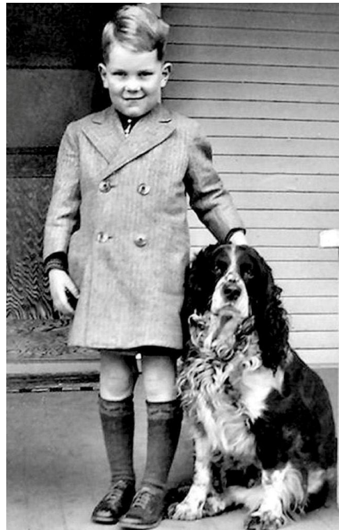
With dog Skippy in Kamloops, 1941