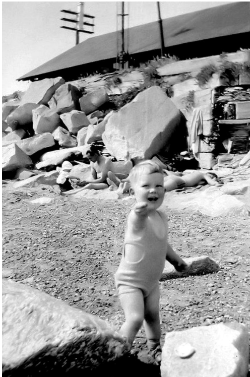
The beach in White Rock, 1938 or '39