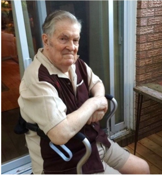
In Ottawa in 2020