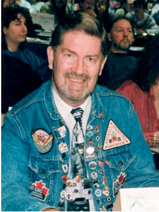
AT CUPE National Convention, Vancouver c1989